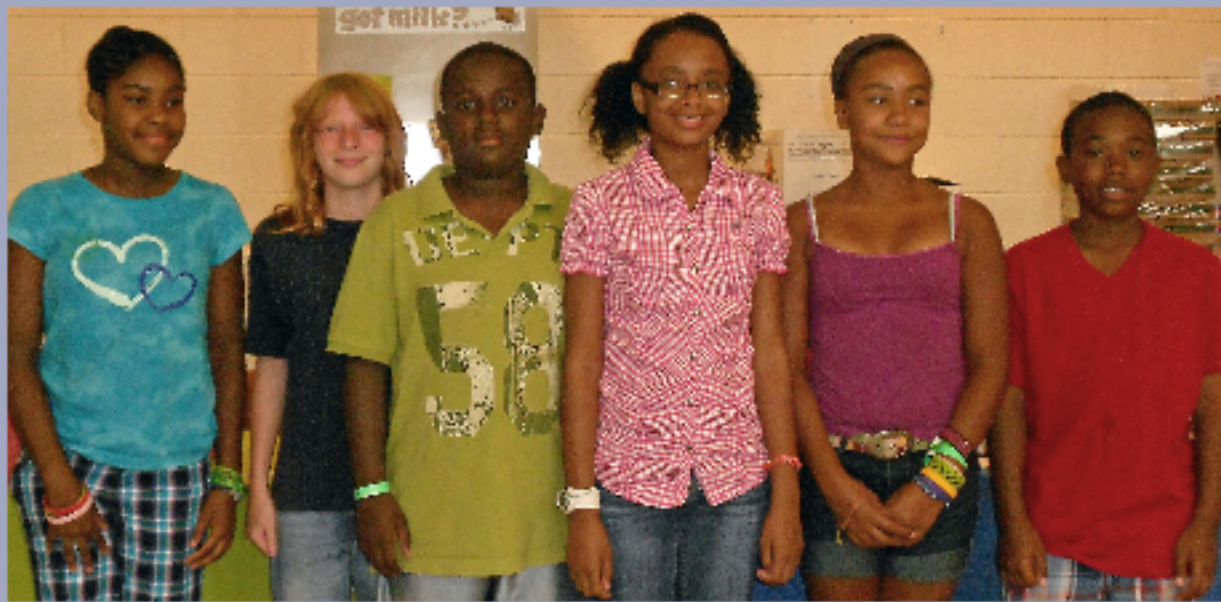
Congratulations to the 2011 Day Care Alumni!

Thank you to the Rotary Club of Oak Park and River Forest for their support of a transition program, "From Hephzibah to Beyond", that focused on preparing our graduates for the middle school experience.