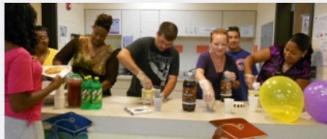
Staff worked hard to make this graduation special

The party featured pizza, cupcakes, soda and plenty of fond memories as family, staff and students discussed the profound impact Hephzibah's Day Care Program had in their lives.